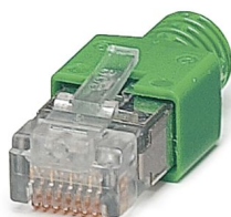
RJ45 connector, design: RJ45, degree of protection: IP20, number of positions: 8, 1 Gbps, CAT5 (IEC 11801:2002), material: Plastic, connection method: Crimp connection, connection cross section: AWG 26- 24, cable outlet: straight, color: gray, Ethernet

https://www.phoenixcontact.com/us/products/2744856